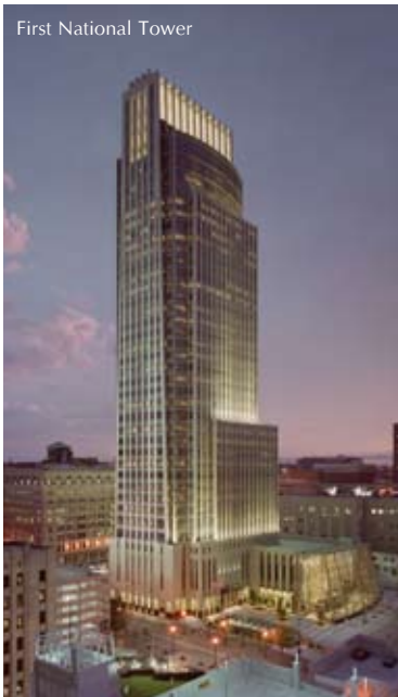
First National Tower