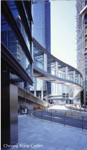
Cheung Kong Center