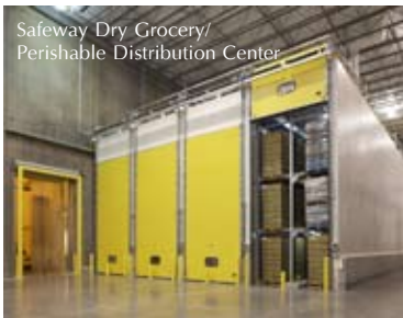
Safeway Dry Grocery/ Perishable Distribution Center