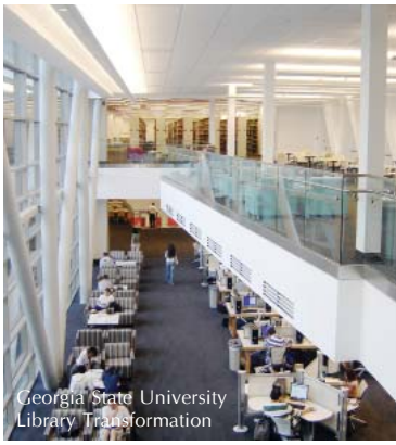
Georgia State University Library Transformation