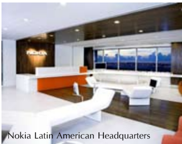
Nokia Latin American Headquarters