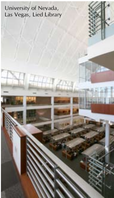
University of Nevada, Las Vegas, Lied Library