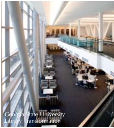
Georgia State University Library Transformation