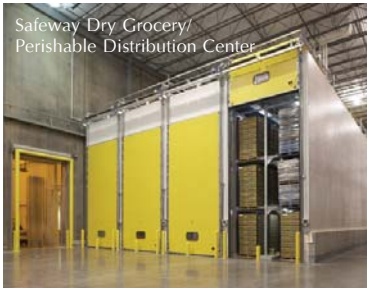
Safeway Dry Grocery/ Perishable Distribution Center