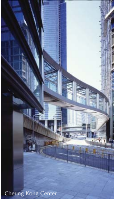
Cheung Kong Center