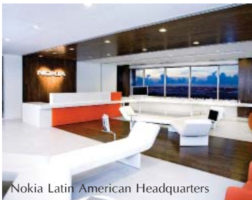
Nokia Latin American Headquarters