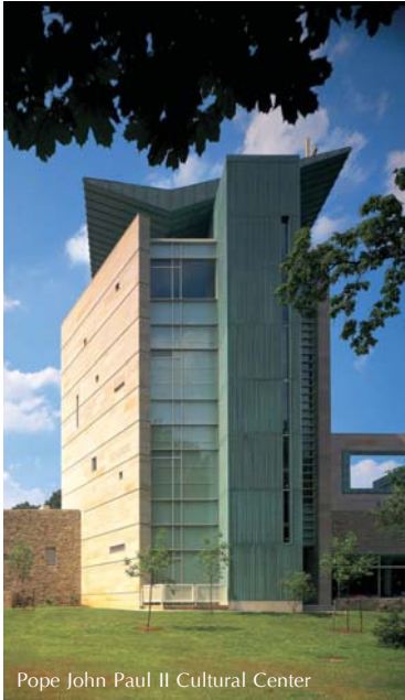
Pope John Paul II Cultural Center