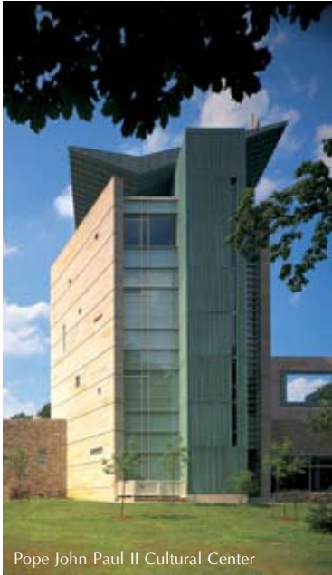
Pope John Paul II Cultural Center